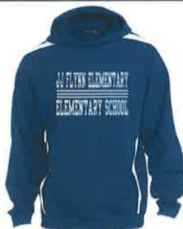
Hooded Sweatshirt with Stripe